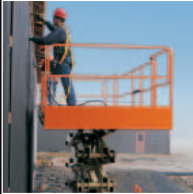
MegaDeck™ Optional Deck Extension Improves Operator Reach for Greater Productivity