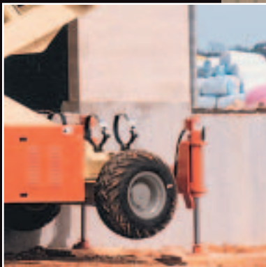
Independently Controlled Leveling Jacks for Enhanced Performance