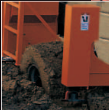
Unmatched Rough Terrain Performance